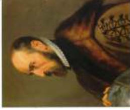
Ortelius brought the entire world's knowledge together in one easy to follow atlas!

Ortelius' seminal work was the "Theatrum Orbis Terrarum" (Theatre of the World), which is considered to be the first true modern atlas. Written by Ortelius and originally printed on May 20, 1570, in Antwerp, it consisted of a collection of uniform map sheets bound together. In this way all existing cartographical knowledge and information about various areas and territories on earth was compiled in one single work.